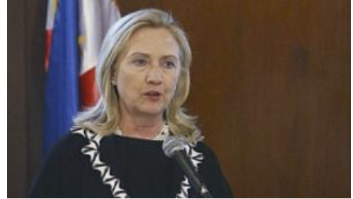
U.S. Secretary of State Hillary Clinton.

A senior U.S. official and an Israeli source familiar with details of the conversation say Clinton called Netanyahu after messages relayed to him in recent weeks on the tax money were not answered positively.