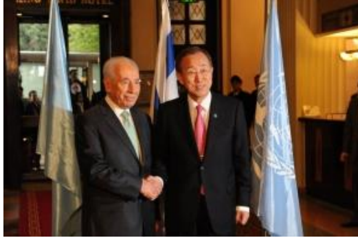
President Peres with UN chief Ban Ki-moon in Jerusalem, February 1, 2012