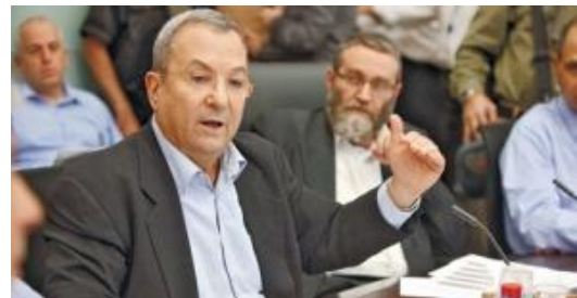
Defense Minister Ehud Barak.

Barak's comments came after some 50 settlers and right-wing activists entered a key West Bank military base on Tuesday, throwing rocks, burning tires, and vandalizing military vehicles.