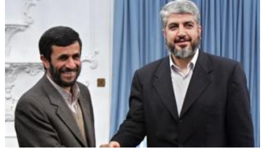
Iranian President Mahmoud Ahmadinejad and Hamas political leader Khaled Meshal.

with arms and suspend the training of its military activists.